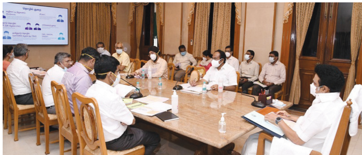
Chief Minister Stalin chaired the review meeting on the performances of the industries in Tamil Nadu. Industries Minister Thangam Thennarasu, officials were also present.

The Chief Minister said sportspersons are the pride of the country and the State government would always support them.